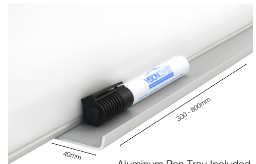
Aluminum Pen Tray Included