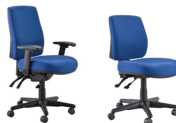
Roma 3L High back, with arms Roma 3L Mid Back