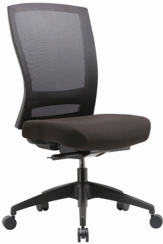
Buro Mentor chair with nylon base