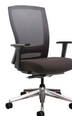
Featured with arms

The Buro Mentor offers the latest in contemporary and ergonomic design. The Mentor is a stand out candidate for any board room, office or home office environment. Featuring a complete range of ergonomic features, easy to use synchronised seating adjustments and outstanding comfort.