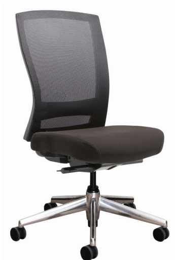
Buro Mentor chair with polished base