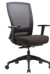
Featured with arms

The Buro Mentor offers the latest in contemporary and ergonomic design. The Mentor is a stand out candidate for any board room, office or home office environment. Featuring a complete range of ergonomic features, easy to use synchronised seating adjustments and outstanding comfort.