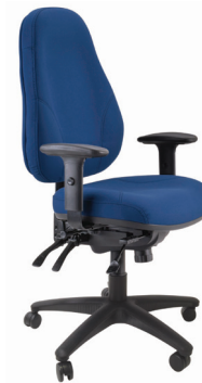
Buro Persona 24/7 - Navy Blue Fabric