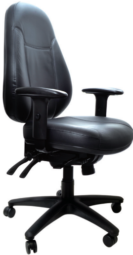
Buro Persona 24/7 - Leather Seated