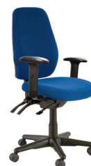
Featured in Dark Blue, with arms