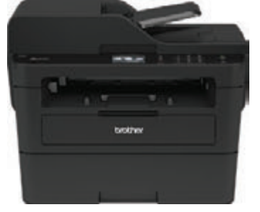
Up to 34 PPM print speed

Automatic 2-sided (duplex) print, scan, fax & copy