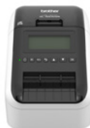
Professional QL Labellers