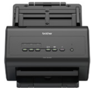
Business Document Scanners