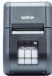
Rugged Receipt and Label Printers